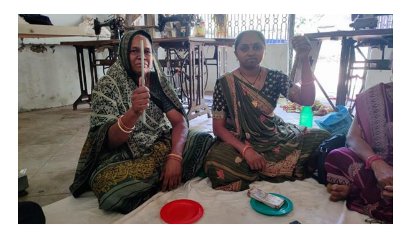
Photo 5 : KSs with the tools they use in their trainings to WFs - chain, stick, red plate and green plate, currency notes.

Similarly in another activity, women are asked to hold up a chain (or something similar, as demonstrated by the KS on the right Photo 7 below). Using this symbolic chain, they emphasize the importance of women holding each other's hands and standing united. The message conveyed is that women must act as peers, learning from one another and providing mutual support. It is through this collaborative effort that women can uplift each other and collectively rise to greater heights.