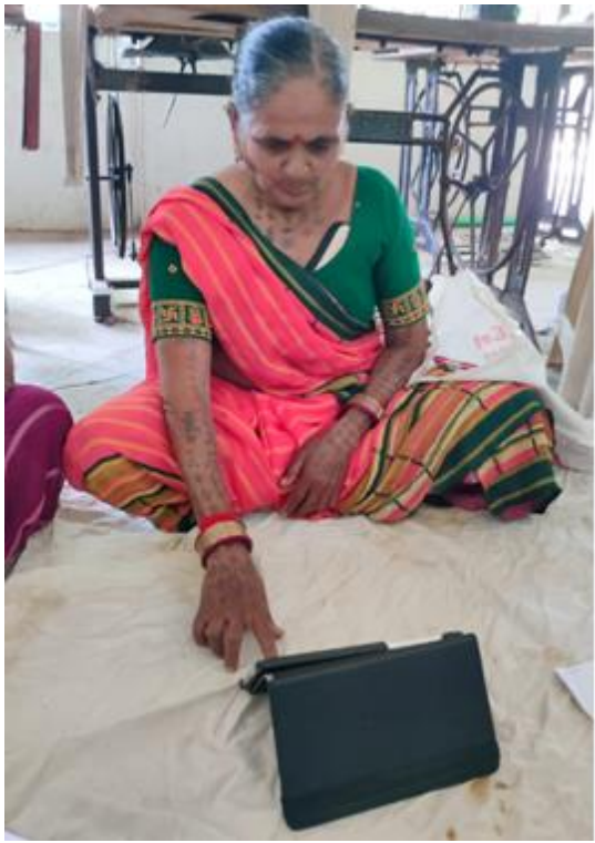
Photo 9: A 65 years old KS uses the tablet to do Utthan's work and show videos to the WFs.

other activities outside their homes. The KSs have experienced increased mobility, with the capability to travel alone to Ahmedabad. Earlier they would only be able to go to Bhavnagar with men. Women have gained more freedom to venture outside their homes, a shift facilitated by men granting them increased independence.